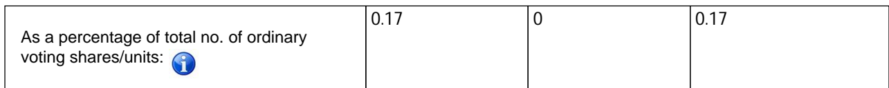
Table 3. Change in respect of rights/options/warrants over shares/units of Listed Issuer